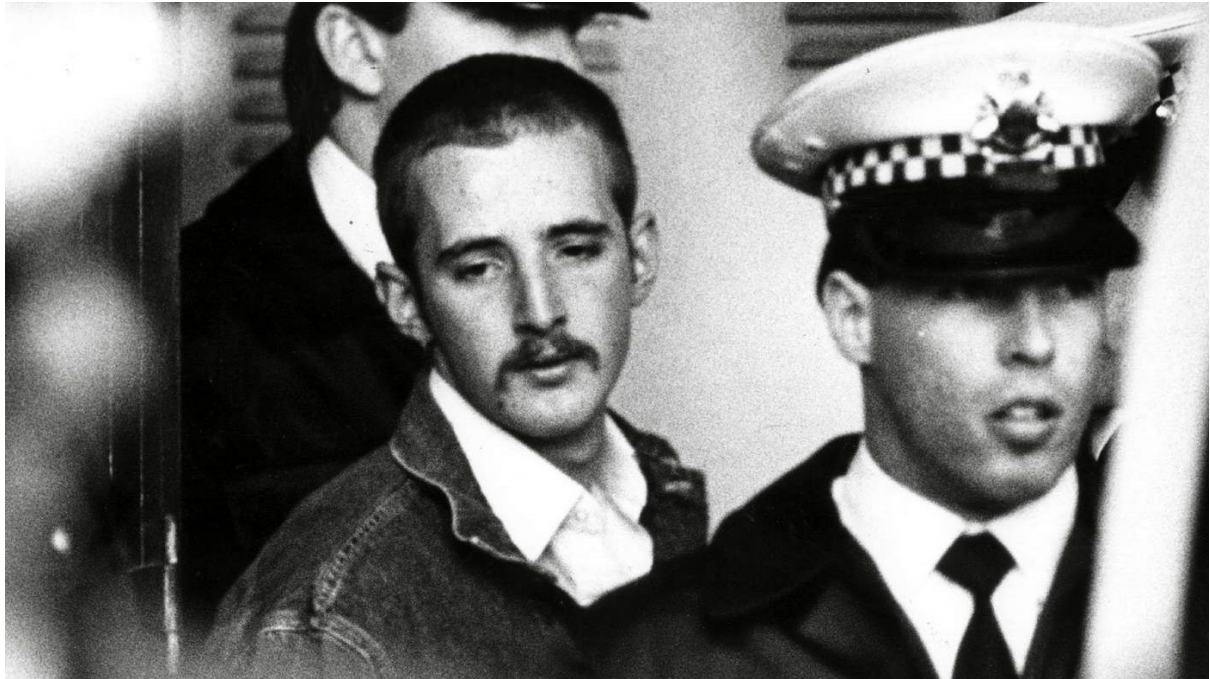
Julian Knight killed seven people in Melbourne

The Hoddle Street massacre was committed by a former soldier who wore combat fatigues.