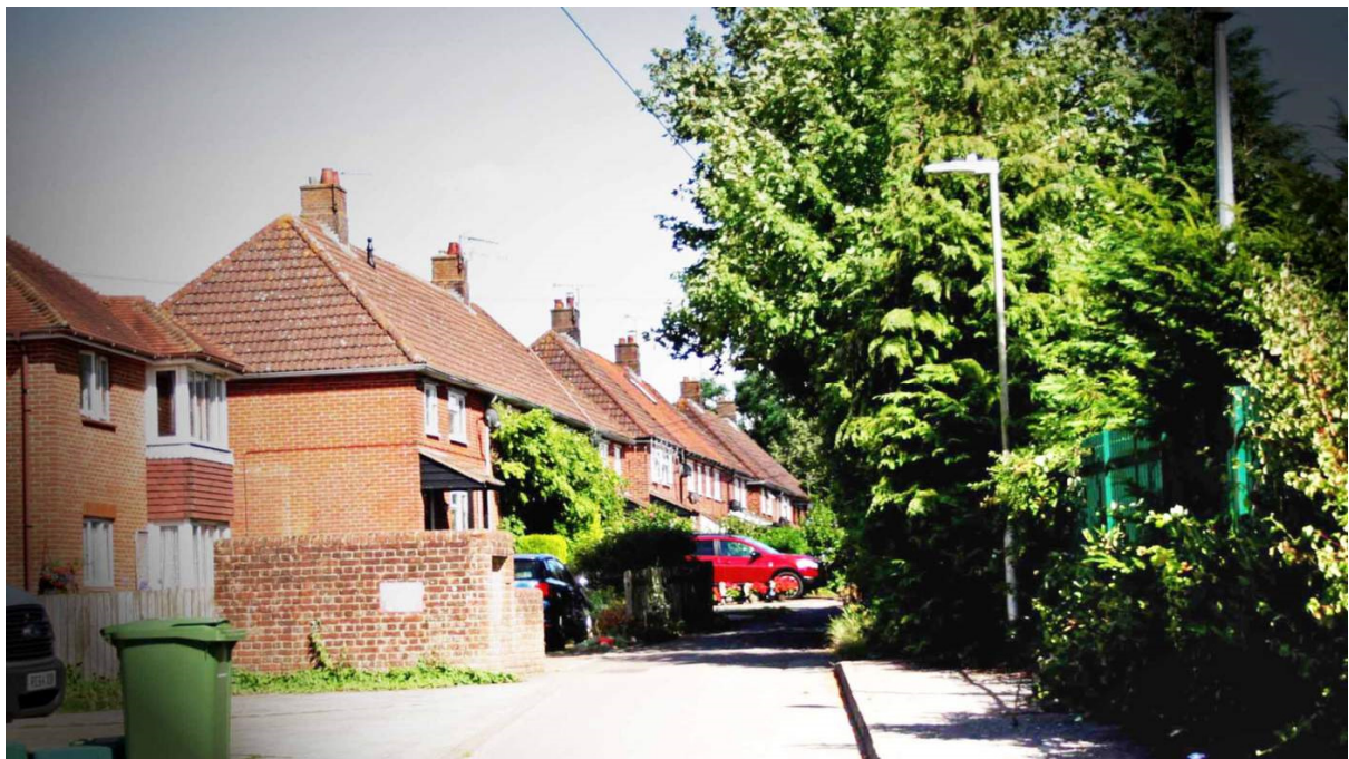
South View became a popular haunt for tourists

The Jacksons had loved their home on South View, with its large garden, and were in the process of buying it.