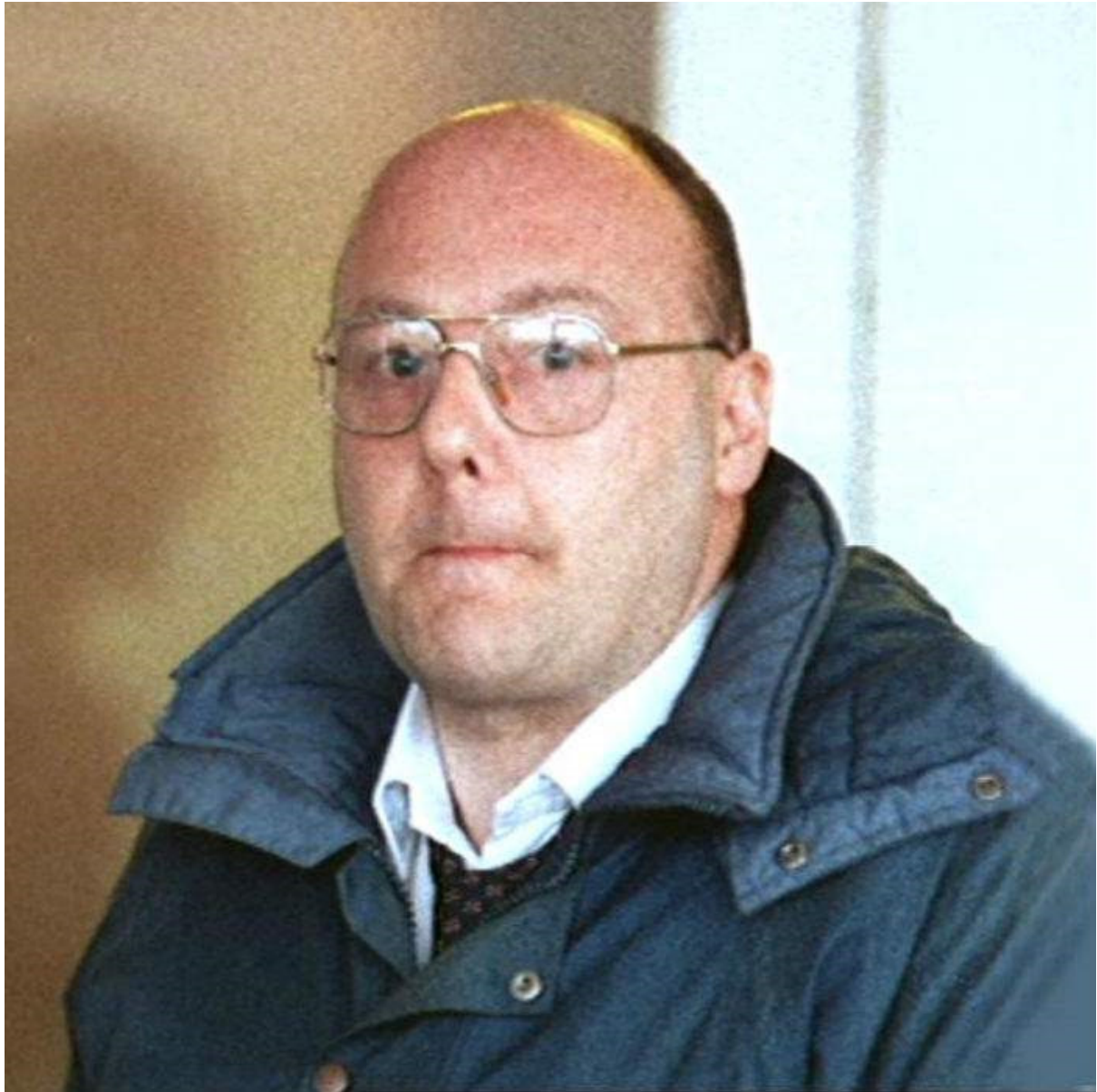
Thomas Hamilton murdered 17 people in Dunblane in 1996